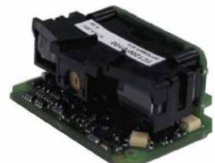
TC1200 SCAN ENGINE MODEL