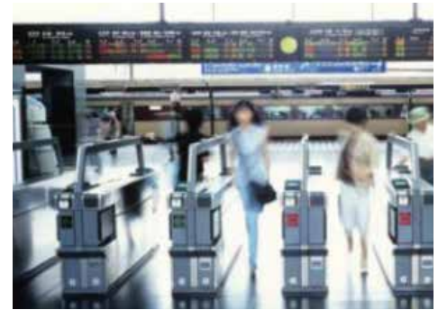
Access control and Ticketing