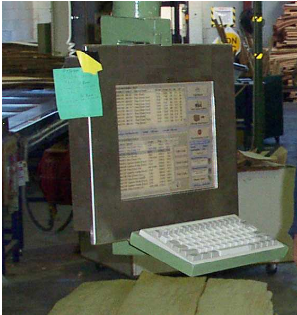
Veneer grading with keyboard attachment